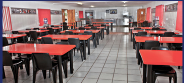
Furniture - Dining Room