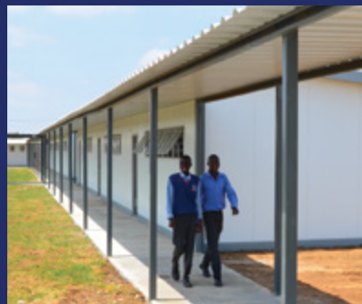
Verandahs / Walkways