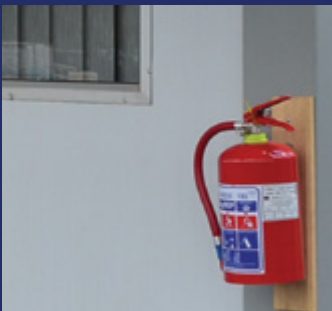
Safety - Fire Extinguishers